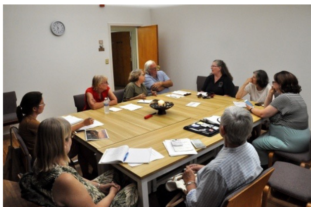
Worship Committee meeting