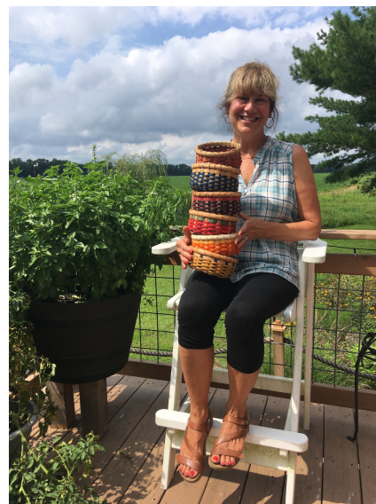
basket weaving class