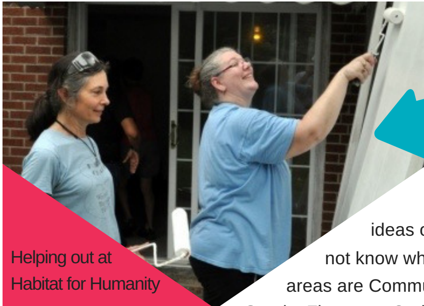
Helping out at Habitat for Humanity